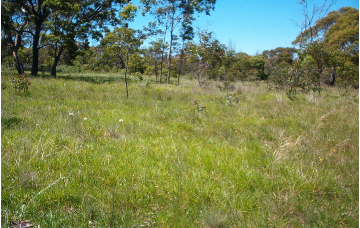
Above: Grassy woodland vegetation in the Northern Zone. This Zone contains the largest area of intact remnant vegetation at the Reserve. Below: The Western Zone contains a small section of very high quality Themeda -dominant grassland.