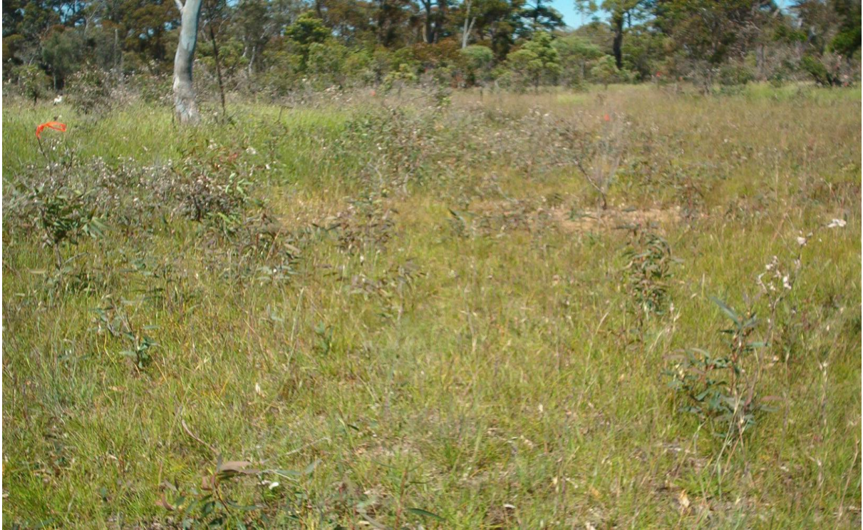
Above: Tree and shrub regeneration is extensive through much of the Reserve. Here Eucalyptus camaldulensis seedlings are emerging en masse through a sparsely treed area of native grassland. Below: Wood and rubbish piles behind houses along the eastern boundary.