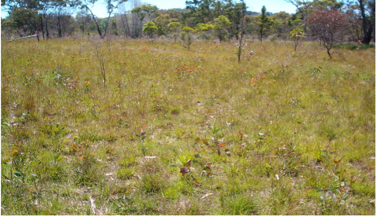
Above: High quality Themeda -dominant grassland is common through the western portions of the Southern Zone. Below: Cytisus scoparius ssp. scoparius and Genista monspessulana , Eastern Zone. Woody weeds are very abundant in the Eastern Zone.