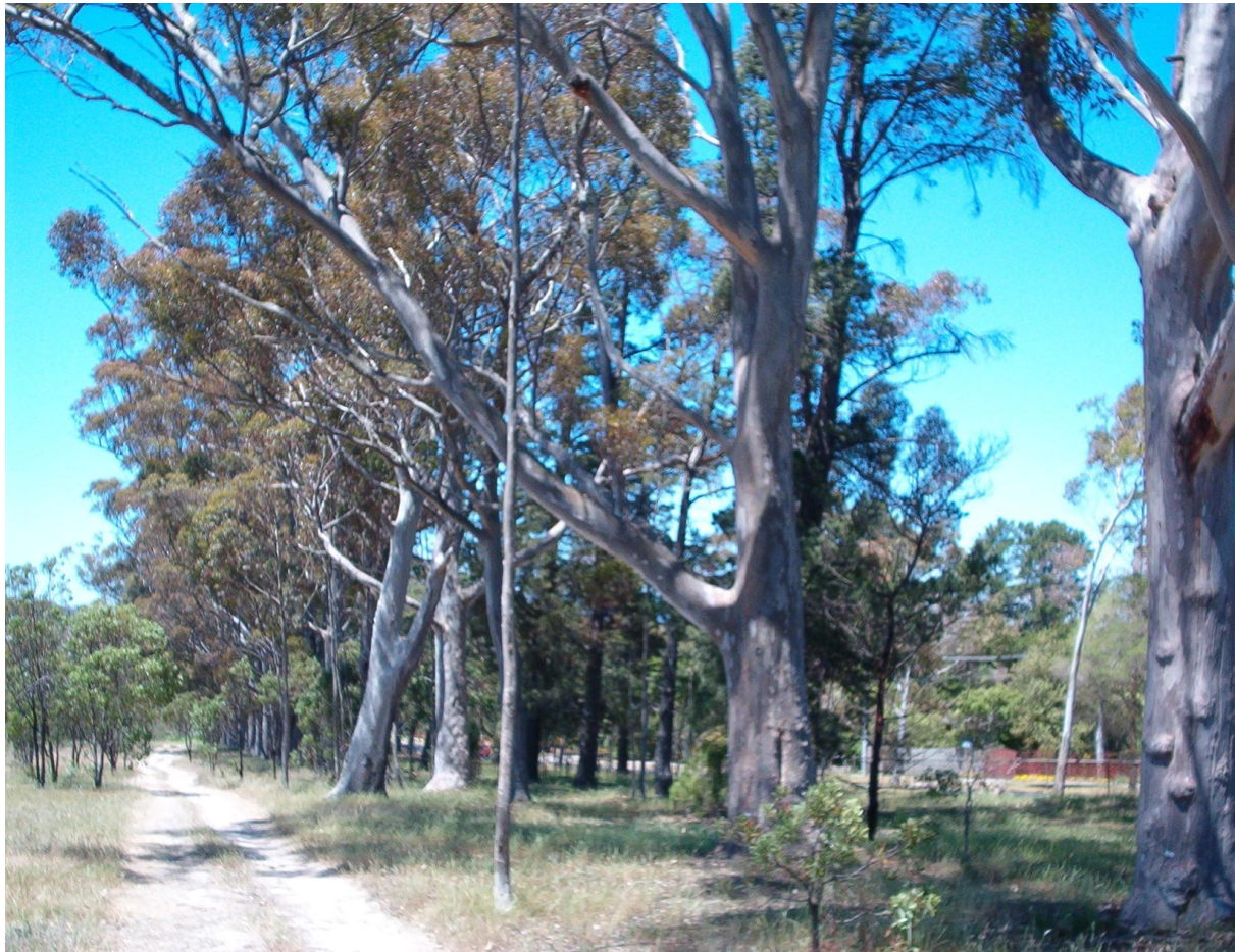
Above: The ornamental row of Eucalyptus cladocalyx , Avenue of Honour.