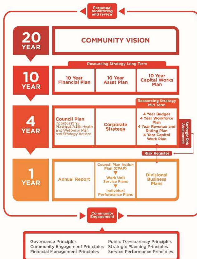
Diagram 1 – Council’s Integrated Planning and Reporting Framework

The following diagram provides an overview of the core legislated elements of an integrated strategic planning and reporting framework and outcomes.