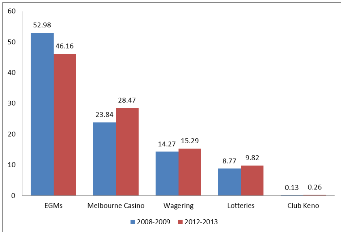
Figure 1 – Total expenditure on gambling, Victoria, 2008-2009 to 2012-2013