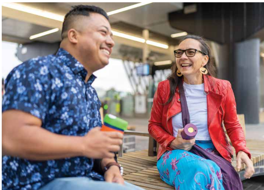
On the streets showing our support for Back Your Neighbour

Australia is made up of thousands of people living in limbo while their applications for asylum are processed. They are wanting to rebuild their lives and give back to the community, but have been denied access to essential health care, housing, work, study, crisis support and more.