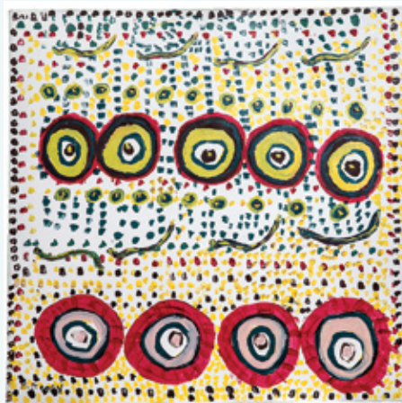
Uncle Brian Birch (Palawa) Untitled (detail) 2006. Synthetic polymer paint on canvas. 80 x 80cm