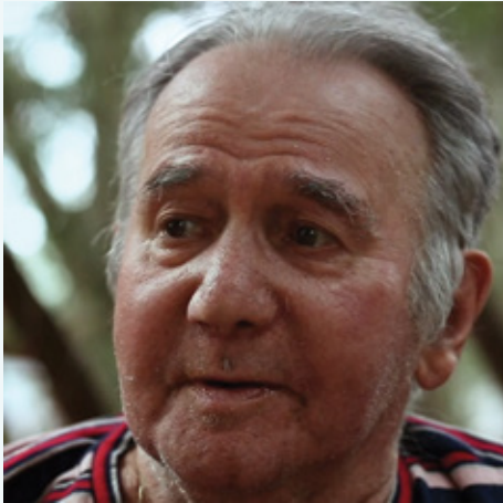
Still from film by Courtney Catherine