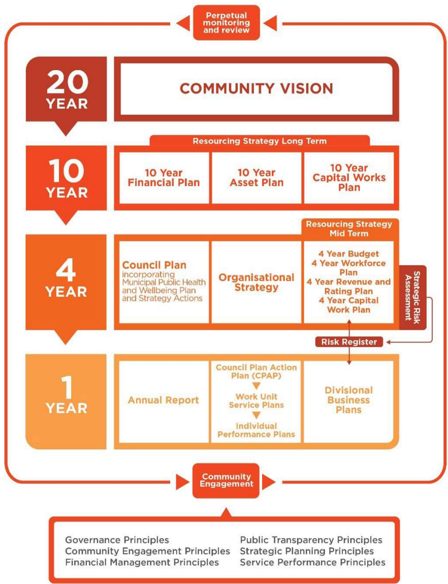
Diagram 1 – Council’s Integrated Planning and Reporting Framework

This plan explains how Council calculates the revenue needed to fund its activities, and how the funding burden will be apportioned between ratepayers and other users of Council facilities and services.