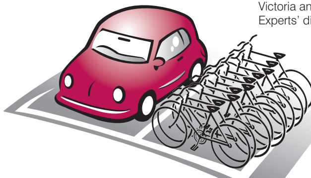
One car space can usually be converted to 10 to 14 bike parking spaces.

In recent years, the bicycle industry has developed a wide range of parking solutions addressing product selection criteria, such as space availability, user preferences and security requirements. The table below provides an overview of the most common bicycle parking systems. For further details, we recommend referring to the 'Bicycle Parking Handbook' from Bicycle Network Victoria and talking to their 'Bike Parking Experts' division