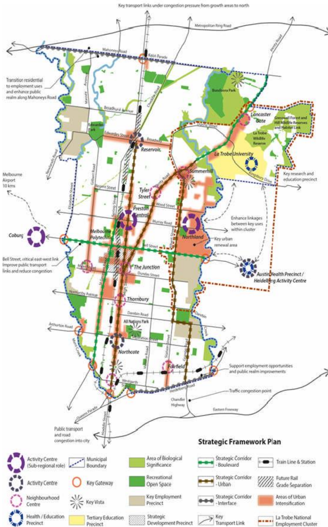
Figure 2: Darebin Strategic Framework Plan