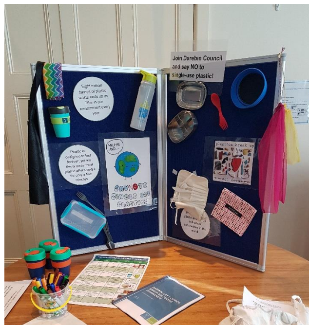
Image: display of reusable items that you can BYO

Many businesses offer discounts for bringing your own cup. Visit responsiblecafes.org to find a local cafe offering discounts near you.