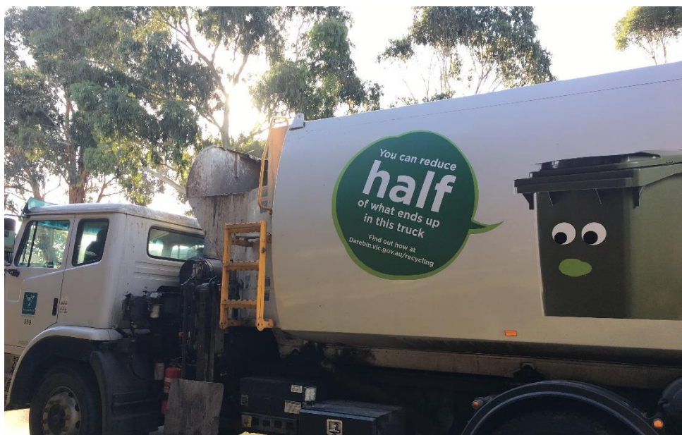
Image: Darebin waste collection truck - “You can reduce half of what ends up in this truck”

Our 2018 household kerbside waste audit shows that up to 40% of what we send to landfill is food waste, and about 15% is recyclable items.