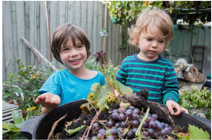
Image: Worm farming is a great option for households with smaller gardens

Space or capacity restrictions mean that not everyone has access to composting systems. We also recommend ShareWaste.com , an online platform connecting people who have food scraps with neighbours who have compost or chickens.