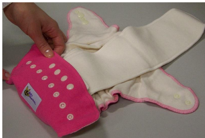
Image: a wide range of cloth nappies are available, making the switch from disposable nappies easier than ever

A staggering 3.75 million disposable nappies are used each day in Australia and New Zealand, and it takes about one cup of crude oil to make each nappy. In Darebin, nappies account for 7% of our waste going to landfill with conventional disposable nappies estimated to take up to 150 years to break down. Consider alternatives such as cloth nappies that can be washed and reused, and/or biodegradable disposable nappies. Download this helpful guide and give reusable nappies a go.