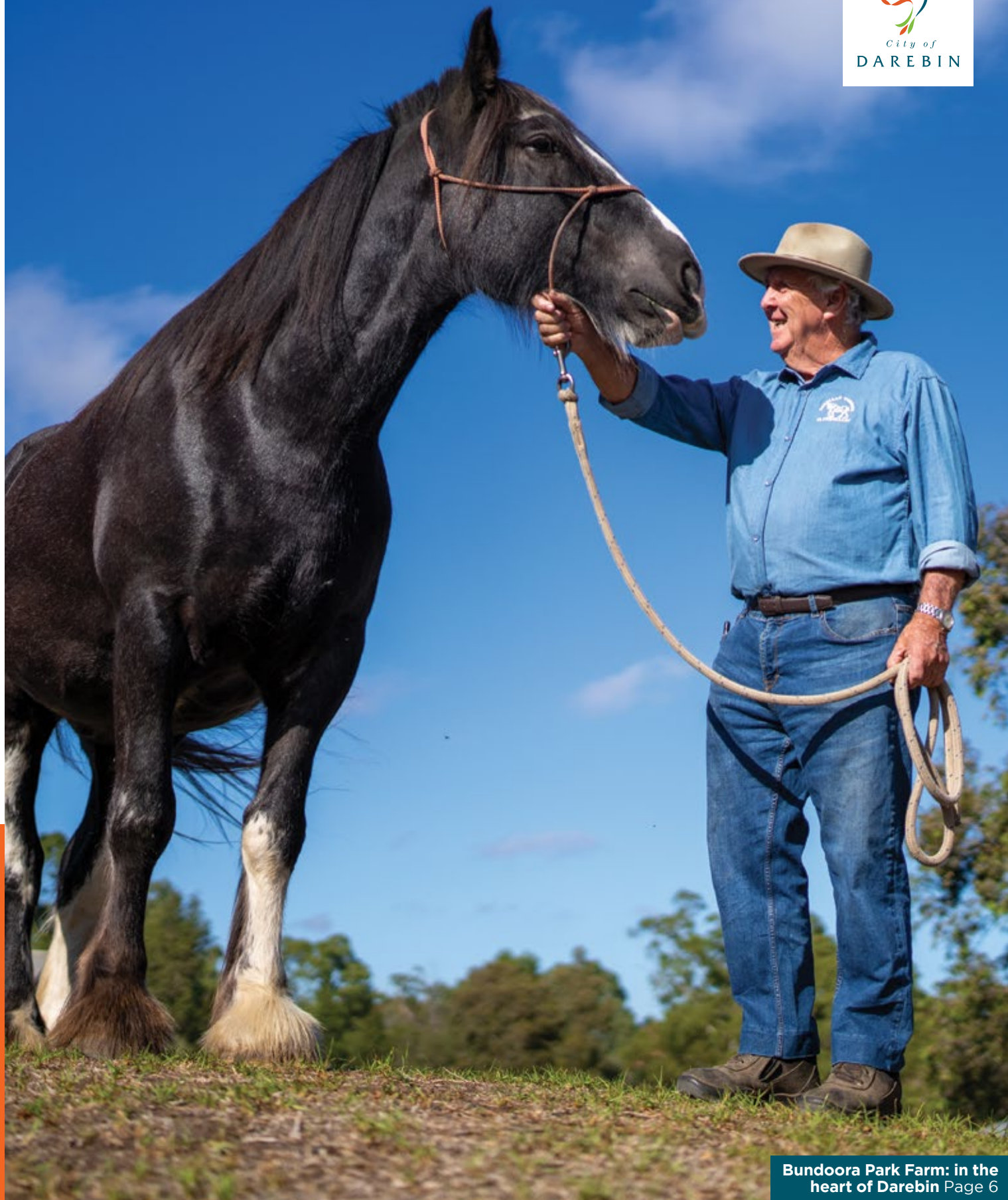
Bundoora Park Farm: in the heart of Darebin Page 6